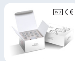
FDA-cleared, CE-marked Gene Profiling Reagents